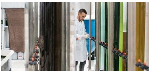
Microalgae cultivation plant

The Galician Enterprise-University Foundation (FEUGA) is responsible of this content.