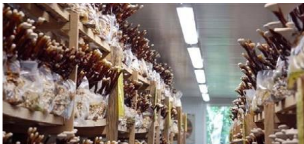
Fungi production greenhouse

For further information check out our website www.micoalga-feed.es and social networks Linkedin, Facebook and Twitter